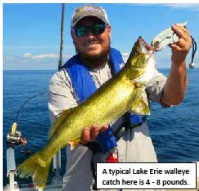
A typical Lake Erie walleye catch here is 4 - 8 pounds.

Chautauqua, New York – May 8, 2024: Lake Erie is the premier walleye fishery of New York State. Anglers can catch walleye here using deep-water techniques, including trolling, drifting, or casting, but trolling is the predominantly accepted method of finding fish in this expansive walleye fishery. Just a few miles off the shoreline from Chautauqua County, millions of Lake Erie walleye reside during the summer months. The deep thermally stratified waters of Lake Erie are found here. Angler access to suspended walleye schools feeding on smelt and alewife forage is a short boat ride. Daily walleye bag limits are standard, with fish 20 to 28 inches long and weighing 3 to 8 pounds. Trophy fish exceeding 30 inches and 12 pounds are among occasional catches, too. There are 10 angler walleye tournaments set for 2024. Anglers can harvest 6 fish/day, 15 inch/minimum.